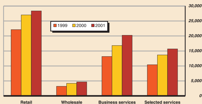
Enterprise numbers by sector