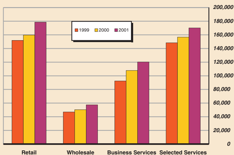
Employment by sector